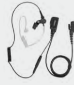
Earpiece with on-MIC PTT & Transparent Acoustic Tube(Black) EAN23*