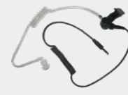
Receive only earpiece with transparent acoustic tube ES-02*