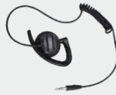
Receive only Swivel type earset EH-02*