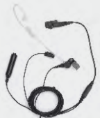
3-wire Surveillance Earpiece with Transparent Acoustic Tube(Black) EAN18*