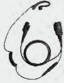
C-earset with on-MIC PTT EHN16*