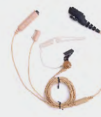
3-wire Surveillance Earpiece with Transparent Acoustic Tube (Beige) EAN17*