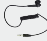
Receive only earbud ES-01*