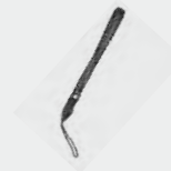
Leather Strap RO04