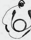
Swivel Earset with on-MIC PTT EHN17*