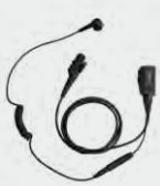
Earbud with on-MIC PTT ESN12*